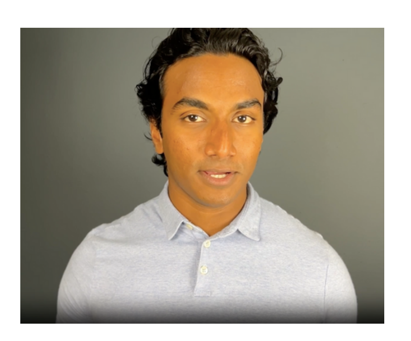
Visit this <u>page</u> to watch more student testimonials